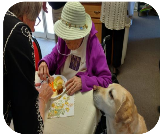
Pickles and Argent at the 90 th birthday party.

Grace Notes is a publication of Grace Church in Buena Vista, Colorado