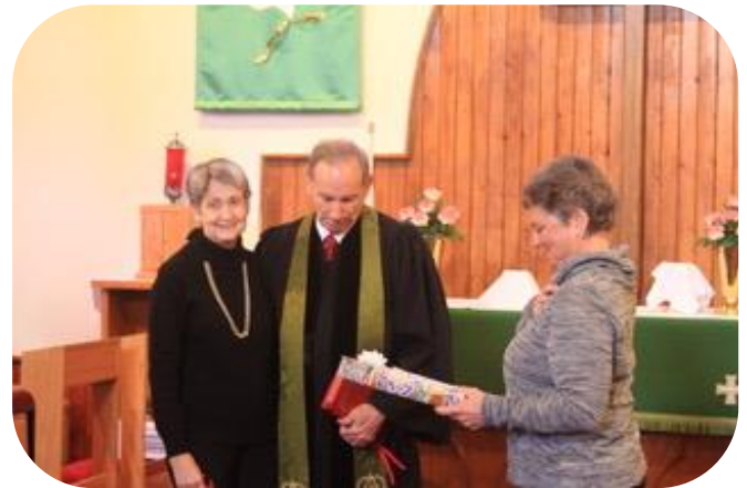
Saying Good-bye to dear friends.

Grace Notes is a publication of Grace Church in Buena Vista, Colorado