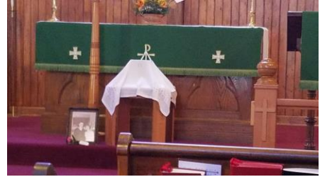
The Altar at the Funeral