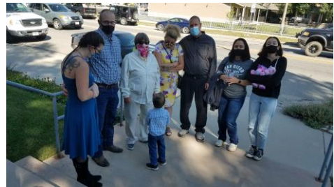
Vi's Family Outside the Church