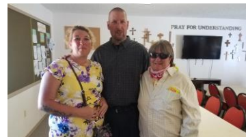
Angel and Brother