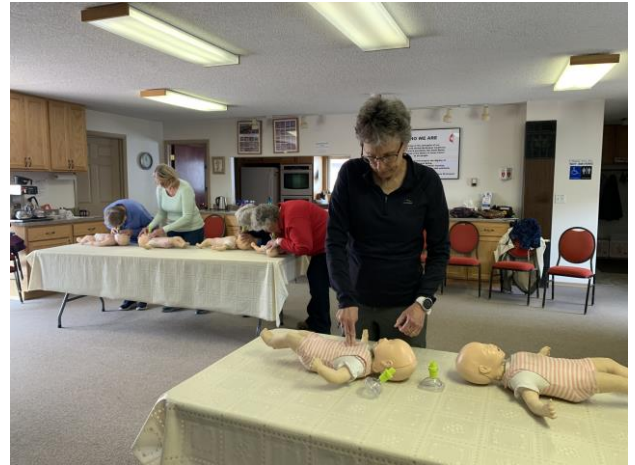
Practicing Baby CPR